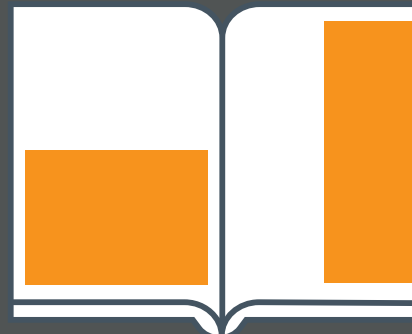
Image Size H260mm x W182mm Bleed Size H307mm x W220mm includes 5mm bleed